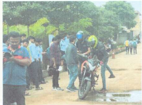
Figure 5- No to Plastic Pollution Drive