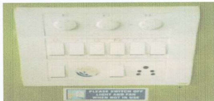
Figure 4:- Signage on Switch Boards