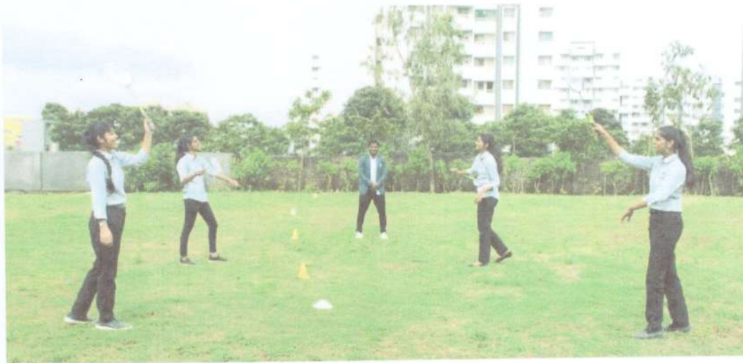
Figure 3- Students Playing on Lush Green College Ground