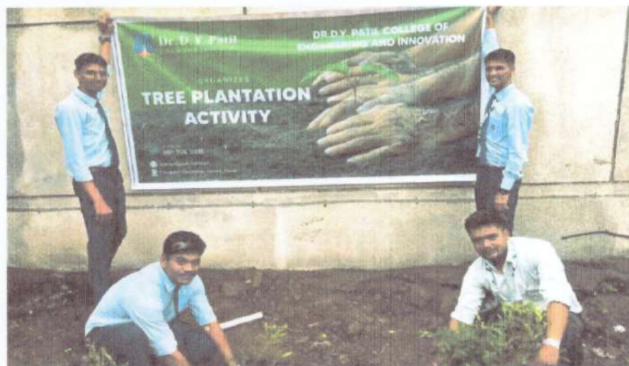
Figure 6- World Environment Day