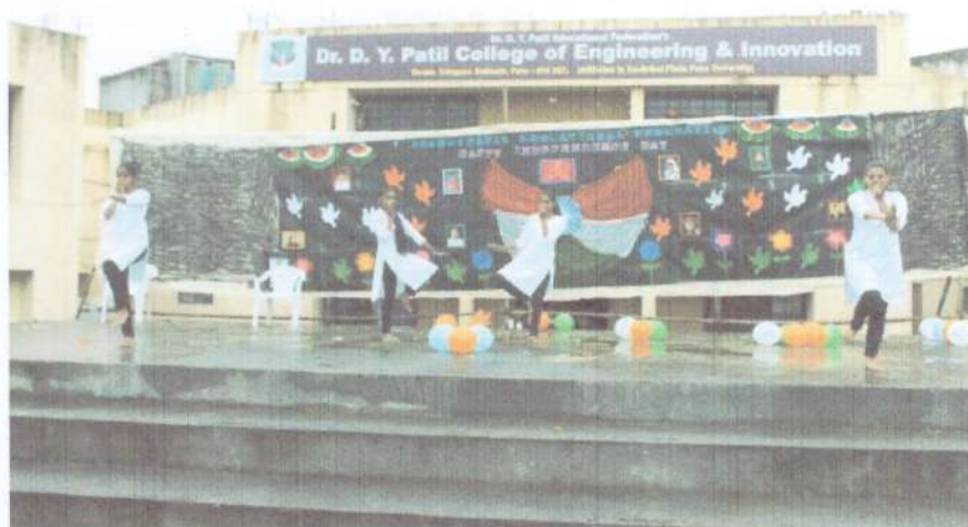
Figure 7- Awareness Drives