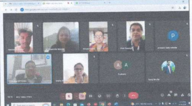
Interaction of all DAB members through the online Google Meet