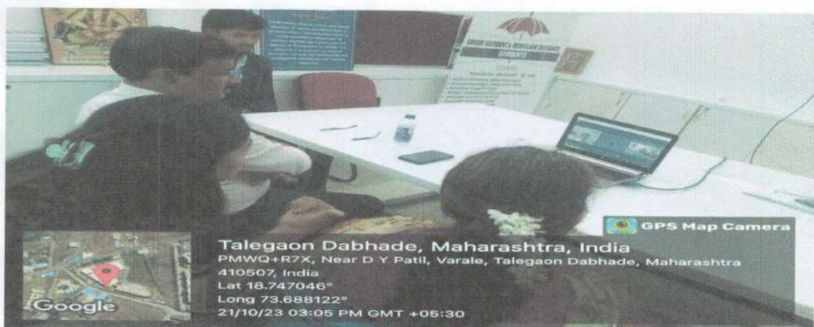
Interaction of all DAB members with the online Google Meets