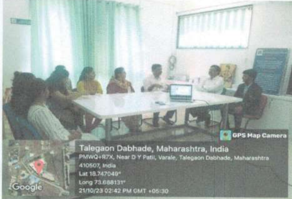
Principal Sir Interacting with all DAB Members