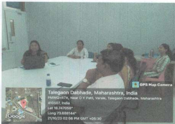
Head of Department Giving Departmental Presentation