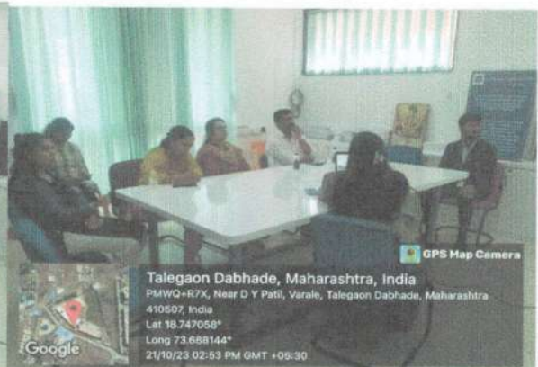
Head of Department Giving Departmental Presentation