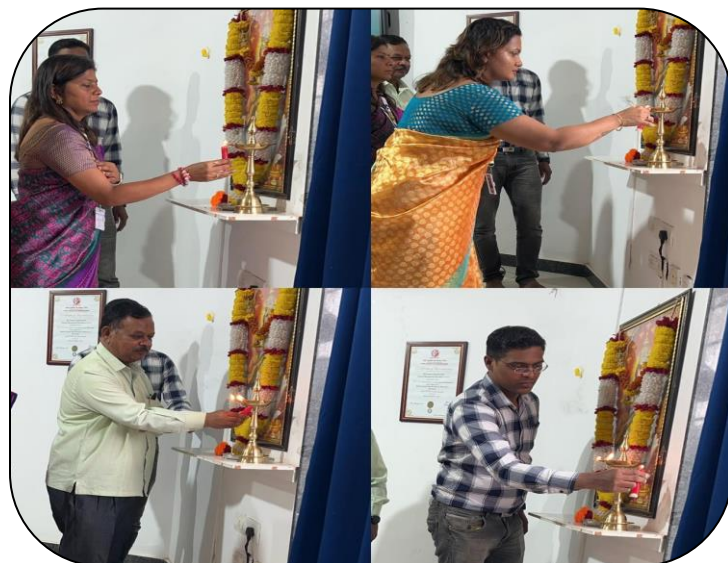
Saraswati Pujan by respected dignitaries on 23 rd July 2024.

Department of Computer Engineering has taken initiative to celebrate Guru Purnima to honour teachers or leaders. Second year students have hosted the program. Program was started with Saraswati Pujan (Goddess of Knowledge and Wisdom) by respected dignitaries followed with felicitation. Students of DYPCOEI has shared their thoughts and delivered speech on this special occasion. Faculties and Head of the computer engineering department has shared their thoughts and motivational words during this event.