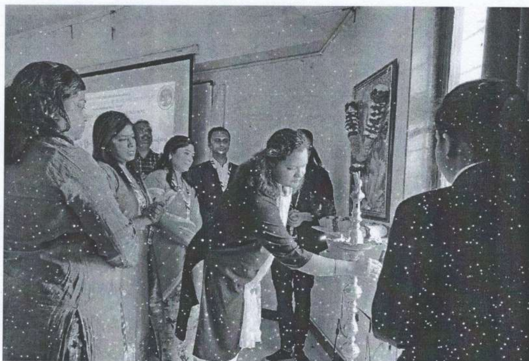
Saraswati Vandana and Lamp Lighting by Dignitaries during the Inaugural function

Web Site: www.dypcoei.edu.in , Email: principal.dypcoei@dypatilef.com