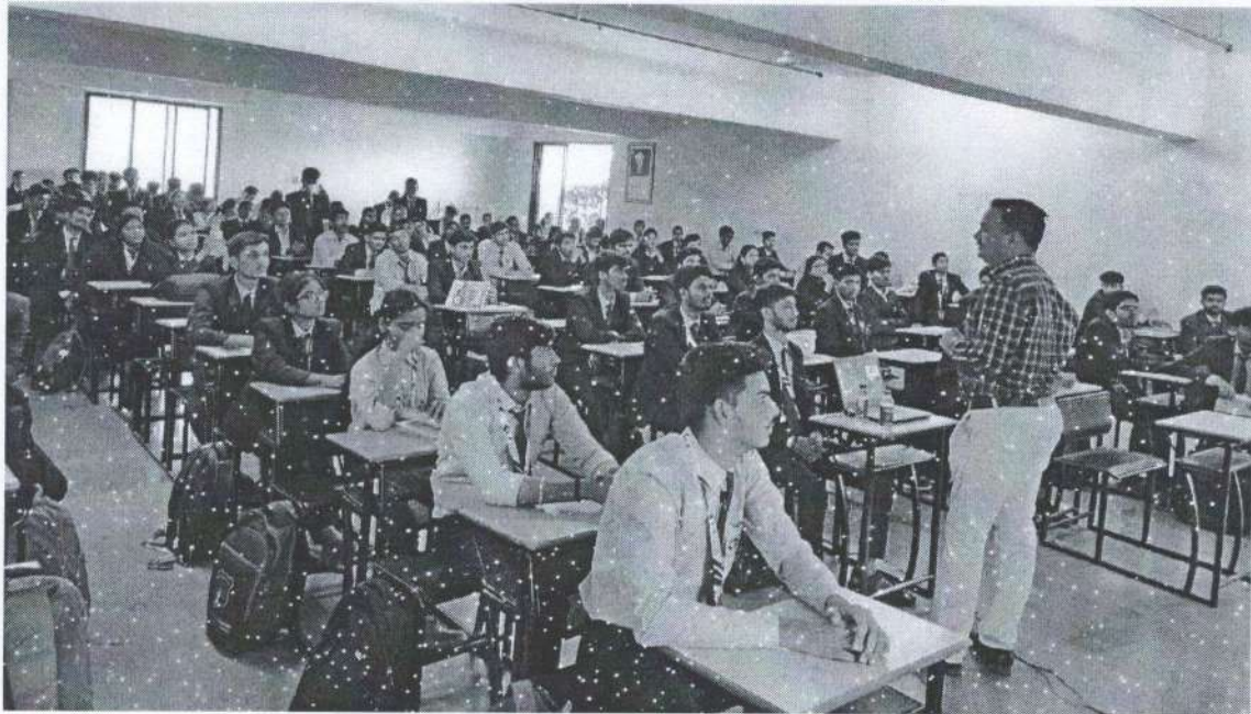
Students of FE attending the expert session

Web Site: www.dypcoei.edu.in , Email: principal.dypcoei@dypatilef.com