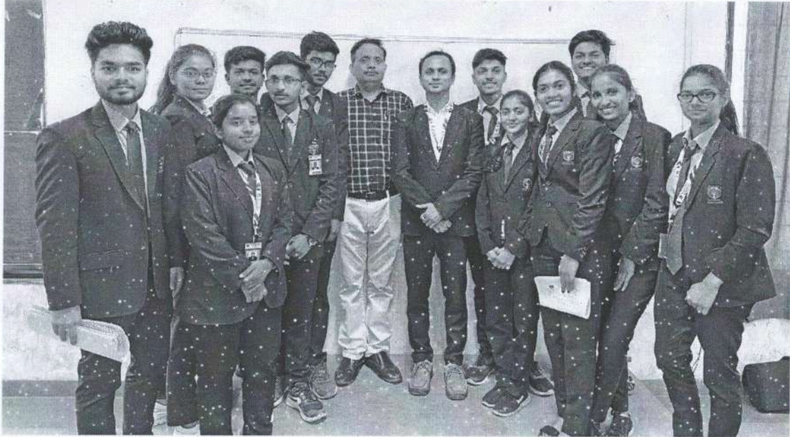
Interstellus Club Student Members and Coordinator of the event with the Speaker

Web Site: www.dypcoei.edu.in , Email: principal.dypcoei@dypatilef.com