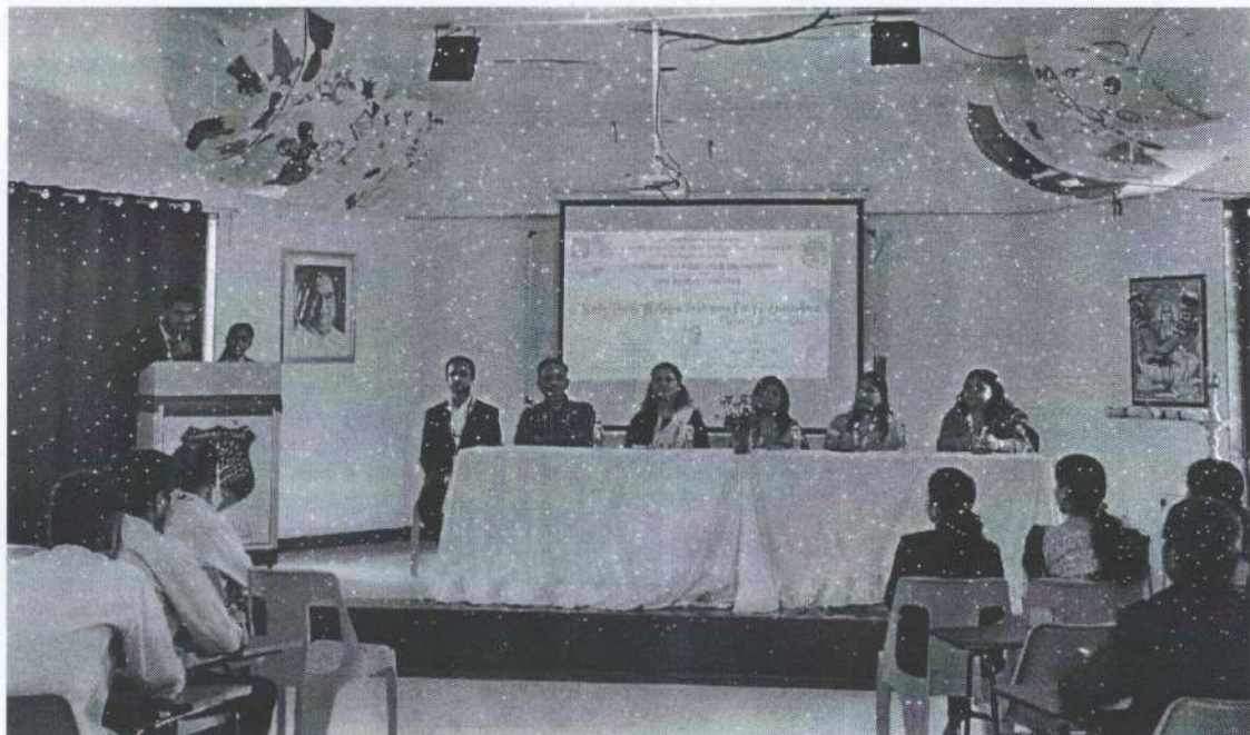
Welcome speech by students of Interstellus Club