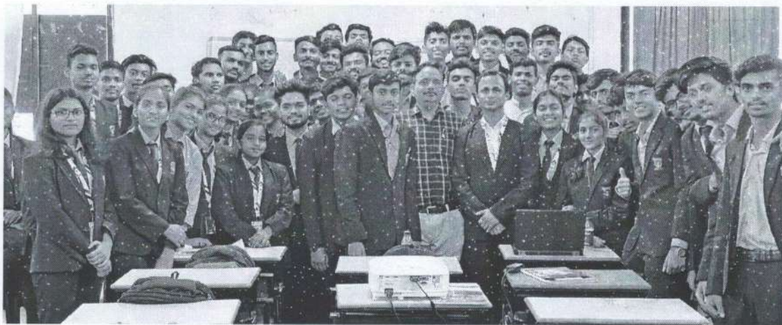
FE Students with the Speaker after the expert session