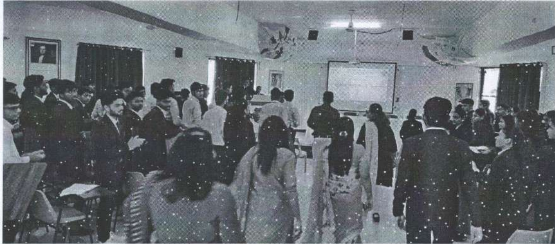
Dignitaries entering the Seminar Hall, DYP COEI, and FE students welcoming guests

Web Site: www.dypcoei.edu.in , Email: principal.dypcoei@dypatilef.com