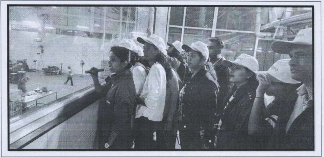
Photo: MAPRO Pvt Ltd Staff Explaining the Working of Company.