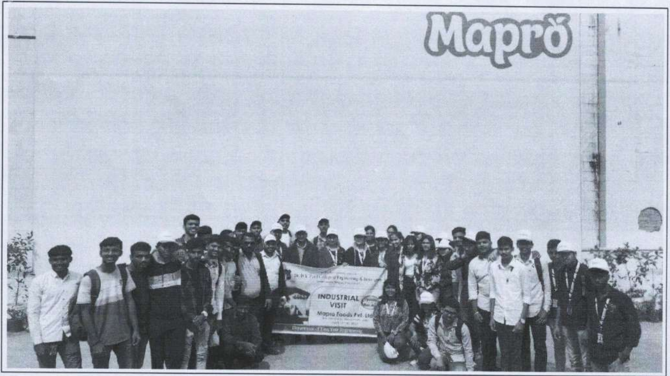
Group Photo: Div B Students with FE Faculties at MAPRO Pvt Ltd