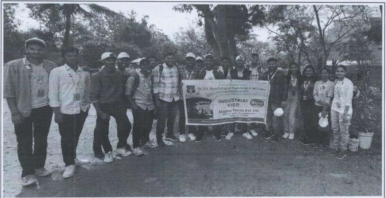
Group Photo: Div C Students with FE Faculties at MAPRO Pvt Ltd