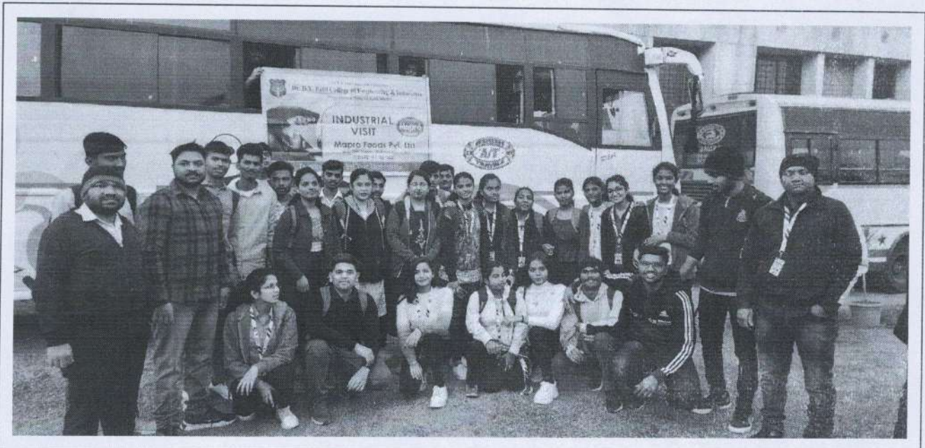
Group Photo: Div A Students with FE Faculties Before Departing