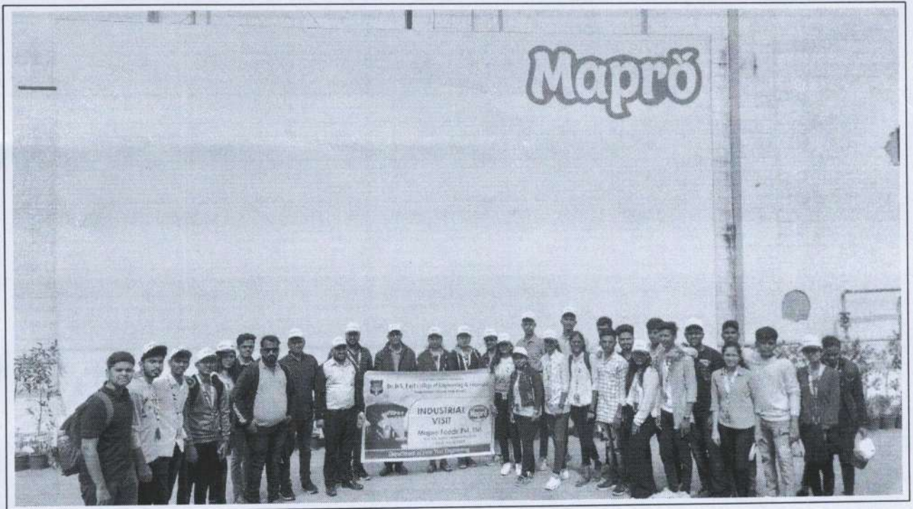
Group Photo: Div A Students with FE Faculties at MAPRO Pvt Ltd Foods.