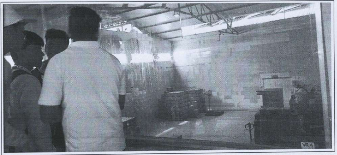
Photo: Storage Room of MAPRO Pvt Ltd