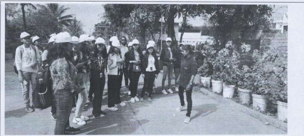
Group Photo: MAPRO Pvt Ltd Guide Touring the FE Students in MAPRO Foods.