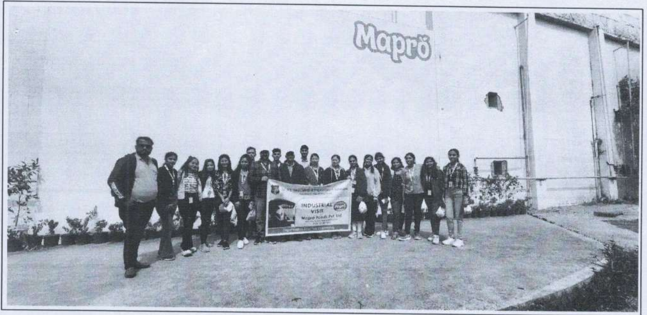
Group Photo: Div D Students with FE Faculties at MAPRO Pvt Ltd