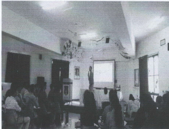
First Year Engineering Students Attending Session