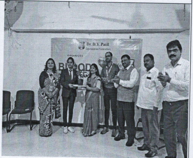
Blood donors were honored with certificates and trees