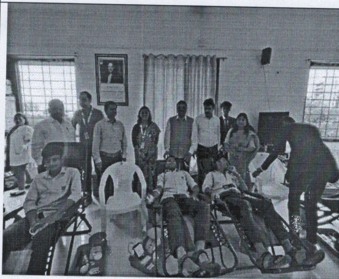
Do good for others by giving from what you have. Surely, it will come back to you with greater value - donate blood